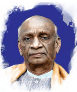
Sardar Vallabhbhai Patel

When India gained independence, there were more than 600 princely states of various size. Their political integration was the biggest challenge faced by the leaders of independent India. There