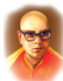
Swami Ramanand Tirth

Hyderabad Freedom Struggle : Hyderabad was the largest amongst the princely states in India. It comprised Telugu, Kannada and Marathi regional sections. It was ruled by Nizam. He put restrictions on the civil and political rights of his subjects to a great extent. To fight against the suppressive policies of Nizam people of the state established various organisations, namely. ‘Andhra Parishad’ in Telangana, ‘Maharashtra Parishad’ in Marathawada and ‘Karnataka Parishad’ in Karnataka. Swami Ramanand Tirtha led Hyderabad freedom struggle skillfully with the help of loyal workers of these three organisations. He founded the ‘Hyderabad State Congress’ and gave a momentum to the struggle for Hyderabad’s accession.